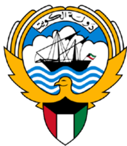
Ministry of Commerce and Industry of the State of Kuwait

The Ukrainian Middle East Business Forum will be held on April 25-26 in Kuwait City, Kuwait. The Business Forum is organized under the patronage of the Ministry of Commerce and Industry of the State of Kuwait and the Embassy of Ukraine to the State of Kuwait in order to bring together investors from the Middle East and Ukrainian companies. The event is aimed at building strong business connections between the countries of the Middle East and Ukraine, facilitating investments and export of goods. The Forum will be held in English.