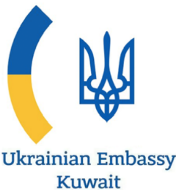
Ukrainian Embassy Kuwait